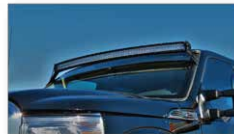
1999-2014 Ford® Super Duty® and Excursion Part # 40163