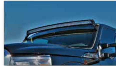
1999-2014 Ford® Super Duty® and Excursion Part # 40163